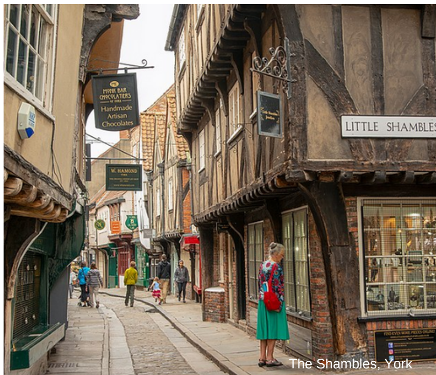
The Shambles, York

York, famous for its ancient Gothic Minster, is a two hour coach trip from Nottingham. Students have a walking tour of this historic walled city. They visit “The Shambles”, unique streets largely unchanged from the Middle Ages with overhanging timber-framed houses, as well as the Minster.