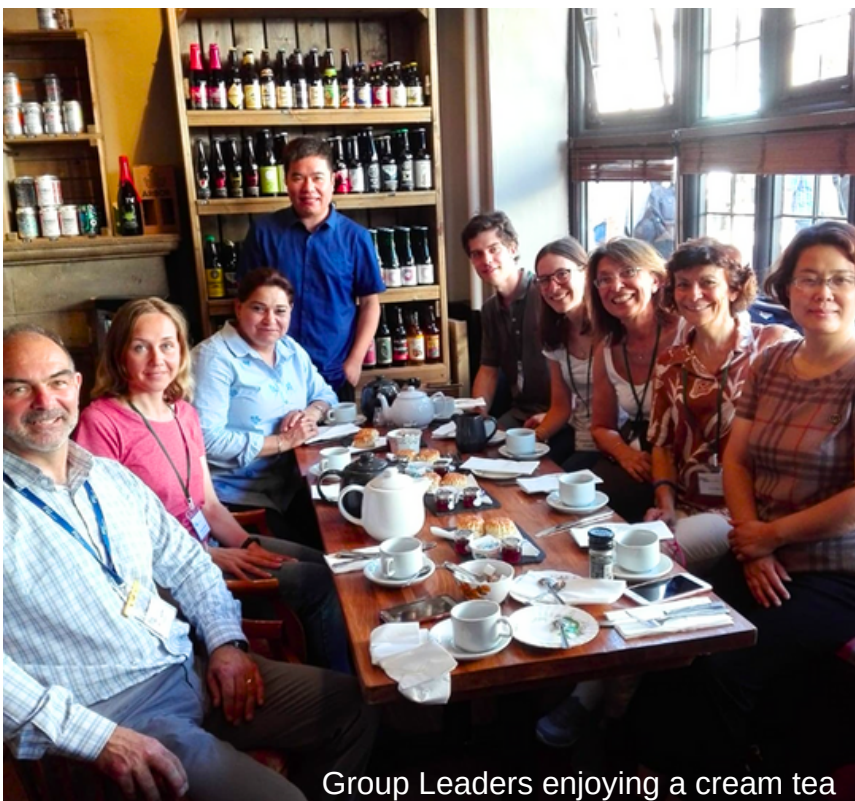
Group Leaders enjoying a cream tea

Elac has a dedicated office and its location will be given out when students arrive. There is also a Group Leaders room on-site where Group Leaders can relax and have access to tea and coffee.