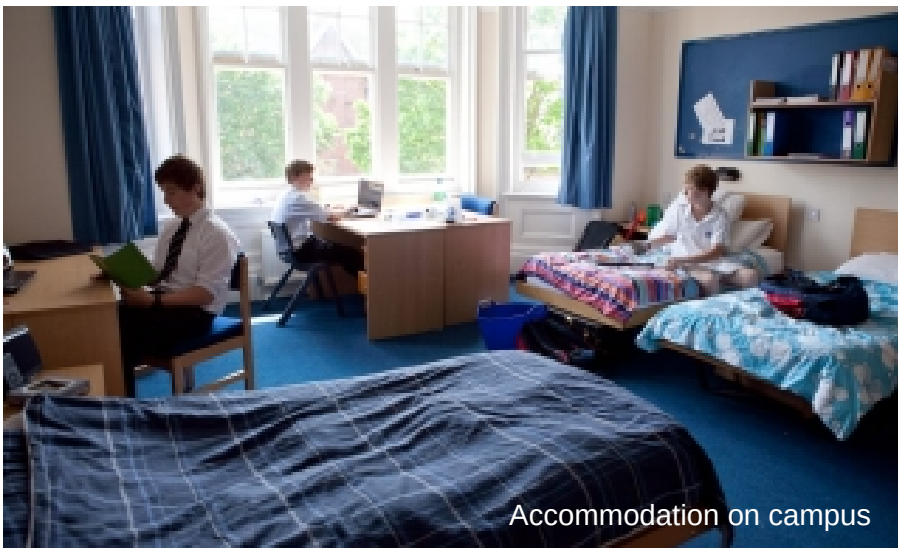
Accommodation on campus

Accommodation is in ten houses located throughout the campus. All are close together and none are more than a few minutes' walk from all facilities. The plan above gives you an introduction to this layout.