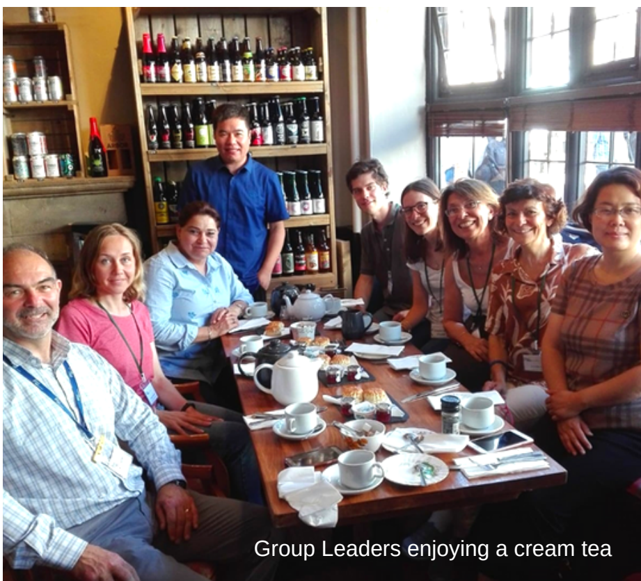
Group Leaders enjoying a cream tea

Elac has a dedicated office and its location will be given out when students arrive. There is also a Group Leaders room on-site where Group Leaders can relax and have access to tea and coffee.