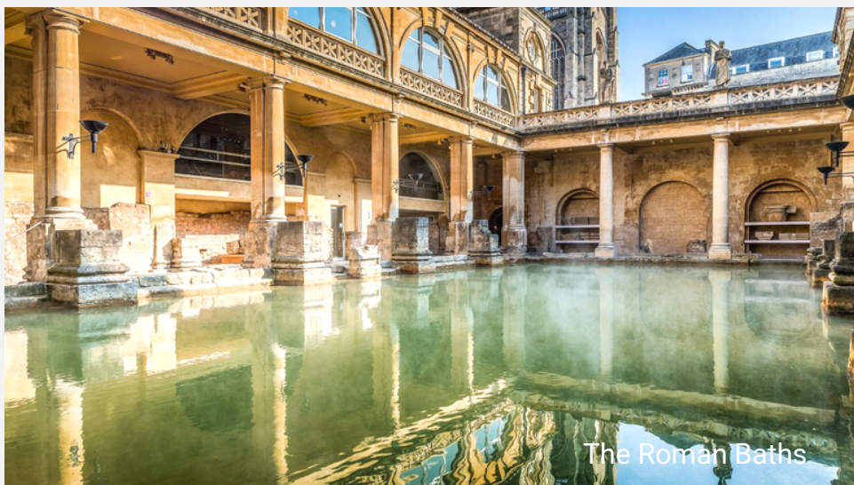
The Roman Baths

*These venues have entrance fees so there will be an additional cost: please talk to the activity manager for more details.