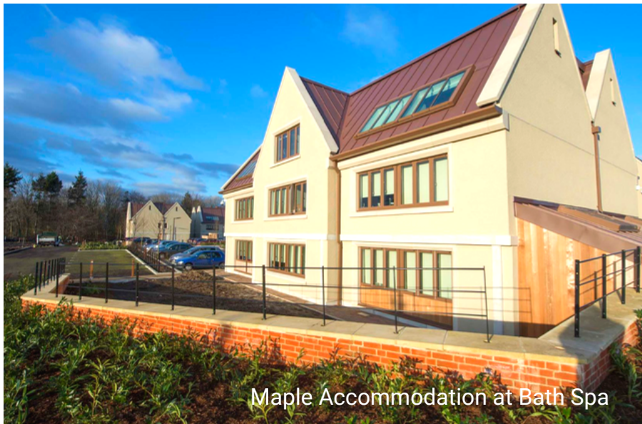
Maple Accommodation at Bath Spa

Modern facilities include state-of-the-art classrooms, ICT, and both indoor and outdoor spaces for drama, art and music, as well as sports fields. There are plenty of green areas for studying and relaxing.