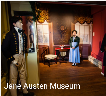
Jane Austen Museum

There will also be time for some shopping, or you may want to organize rowing or punting on the River Isis (* additional cost).