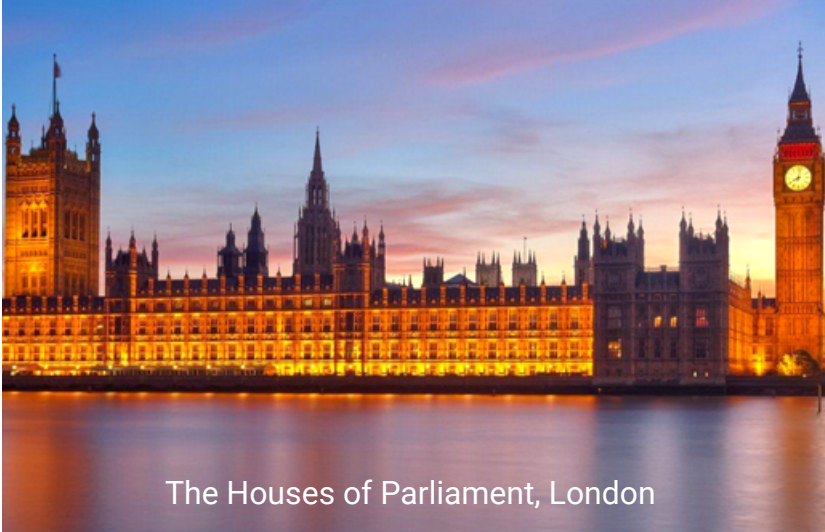
The Houses of Parliament, London

These are a very popular part of our course, and give students an opportunity to use their English as well as learn more about Great Britain. Students have the opportunity to learn more about the trip during lessons. Students travel by coach or train to these destinations. Activity leaders will brief students to follow certain rules for their own safety. On our return, a late dinner will be served.