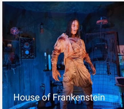
House of Frankenstein