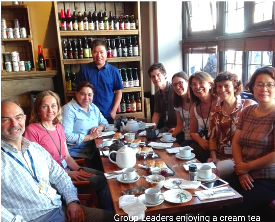
Group Leaders enjoying a cream tea

Elac has a dedicated office and its location will be given out when students arrive. There is also a Group Leaders room on-site where Group Leaders can relax and have access to tea and coffee.